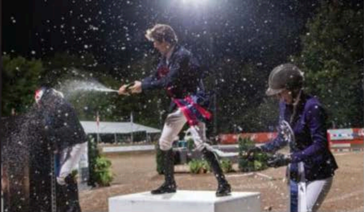
Championship Podium Celebration